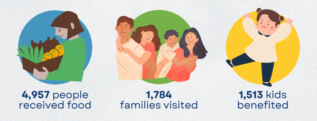
OCS Food Pantry Visits by Month